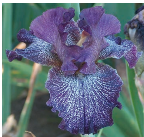
'Dark Storm' (Richard Tasco 2017, TB)