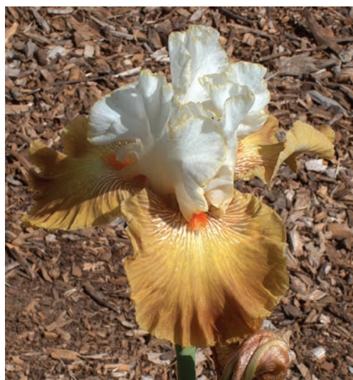
'Copper Angel' (Howie Dash 2018, TB)