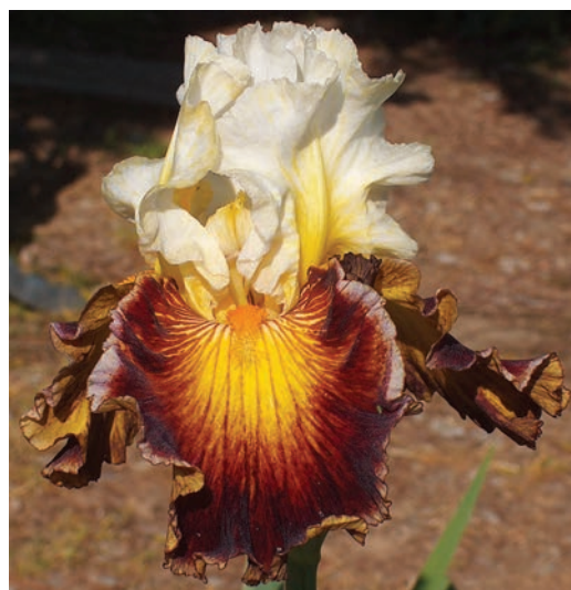
'Centennial Celebration' (Diana Ford 2021, TB)