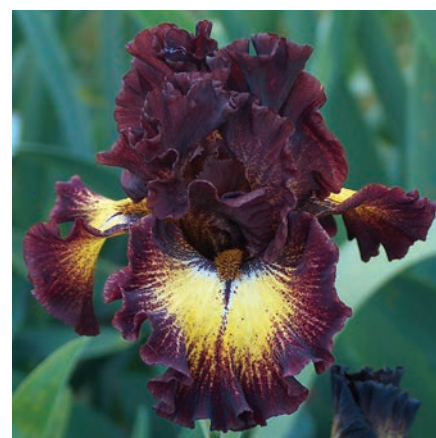
'Flash Mob' (Keith Keppel 2016, TB)