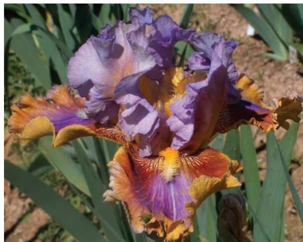
'Decked Out' (Tom Burseen 2015, TB)