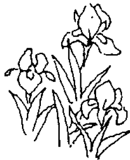
Growth habits of I. pumila

Definition: Bearded iris up to 8 inches (20 cm) in height. Stems are usually unbranched; flowers are 1.6 to 3 inches (4 to 7.5 cm) wide; the earliest blooming of all bearded iris and with pure Iris pumila usually the first to bloom. Early bloom is a very desirable trait in the MDB class as it helps define the class.