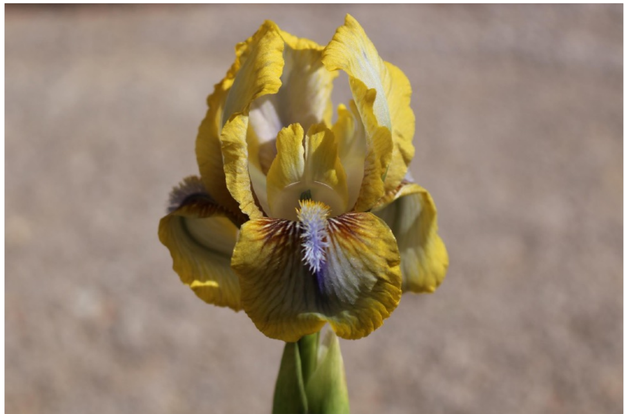
'Vera Anne' (RB 1996) 1/2 aril

There are separate points for arils and arilbreds because arils have no branching. When judging arilbreds of over one-half aril complement, the point scale for arils should be used.