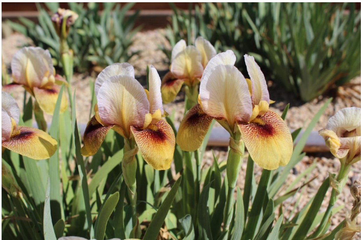
'Noble Warrior' (OGB 2005) 1/2 aril

Arilbreds will not always satisfy the bud count and branching expectations for the bearded classes they may otherwise resemble and should be judged accordingly.