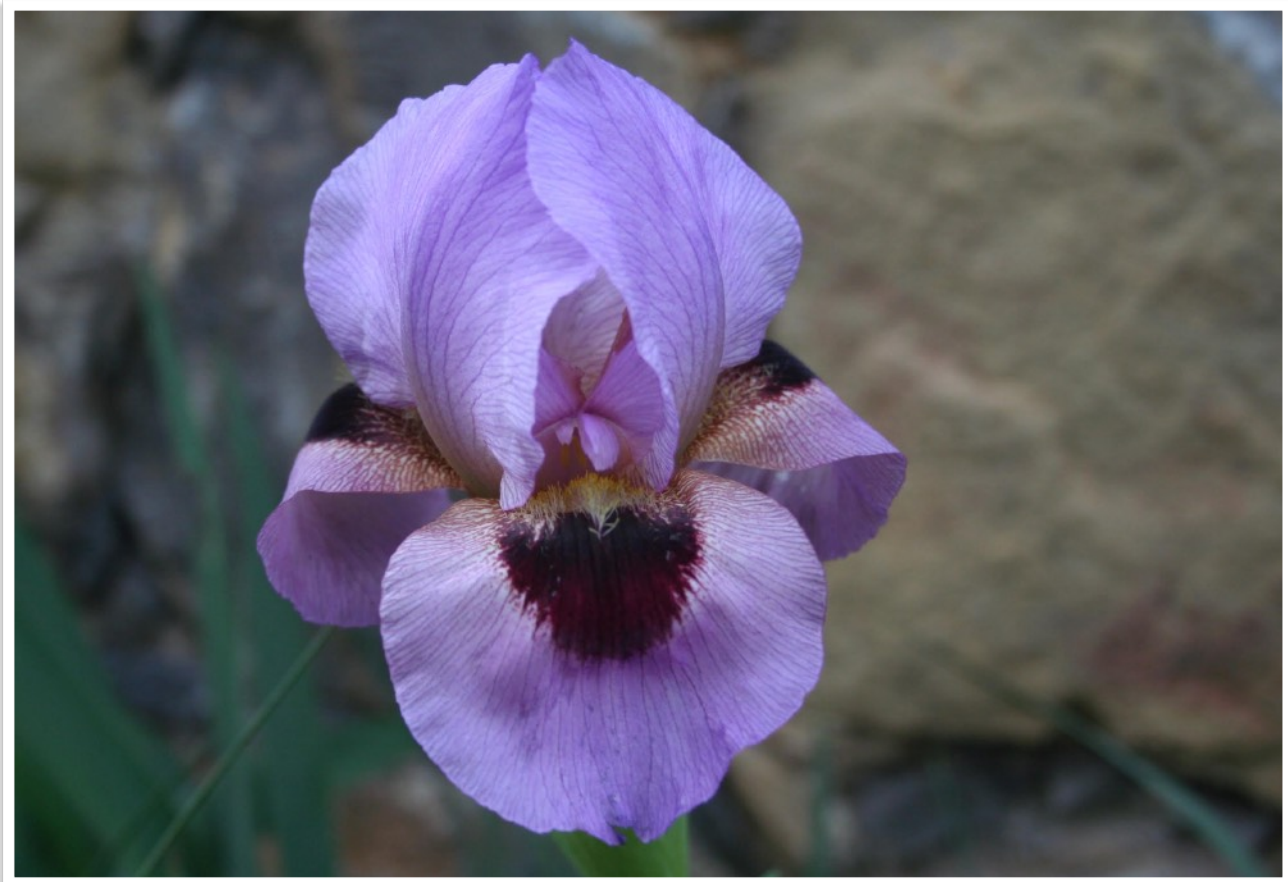
'Byzantine Ruby' (OGB 2010) 1/2 aril