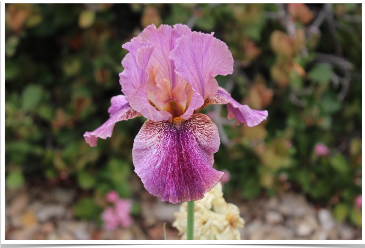
'Sleazy' (RB- 2012) 1/4 aril