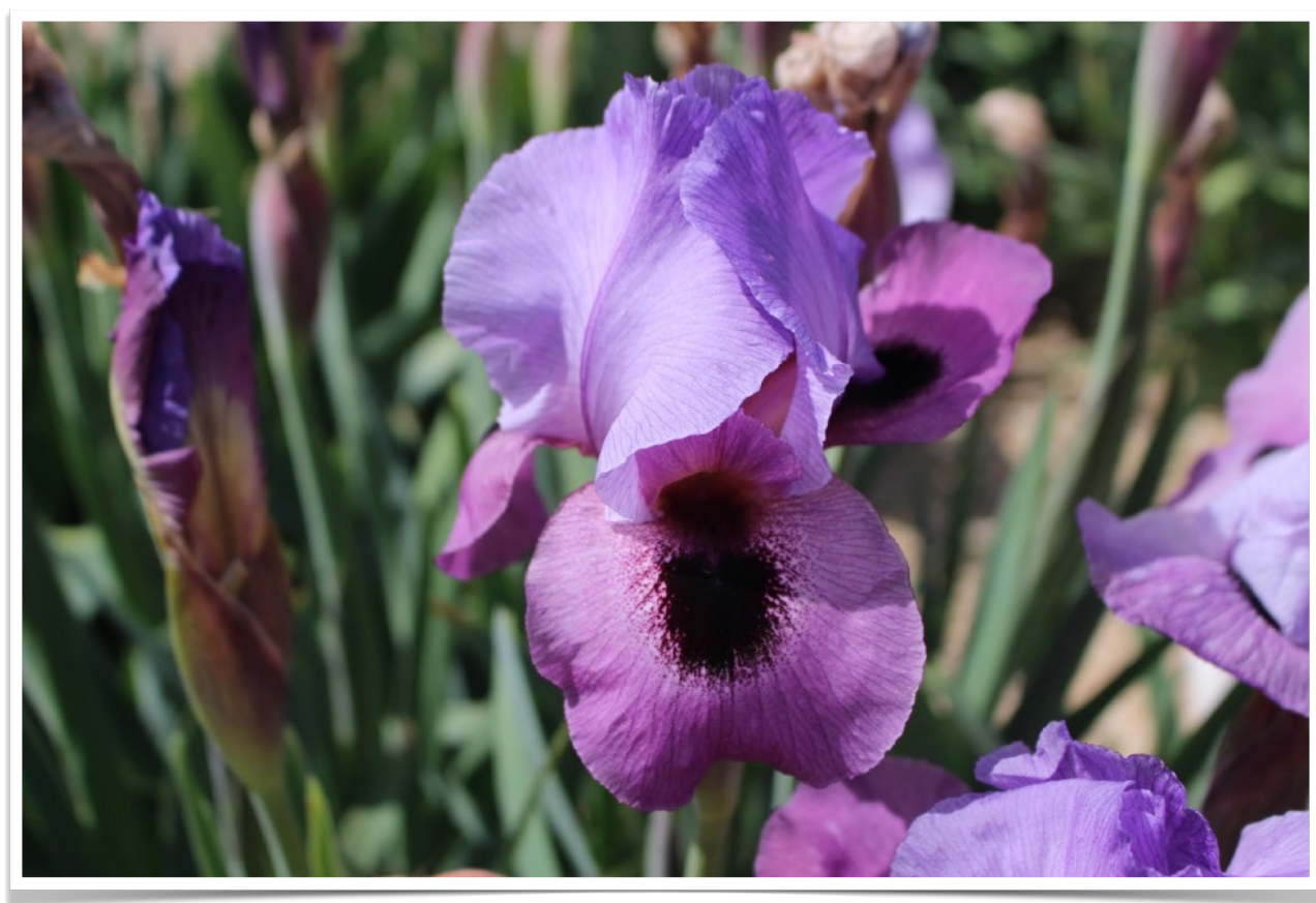
'Persian Padishaw (OGB+ 1988) 1/2+ aril

Color aspects are also more highly rated in arilbreds than in most other iris types. Irregular color flecking, streaking, or spotting in arilbreds that is caused by broken color genetics is acceptable.