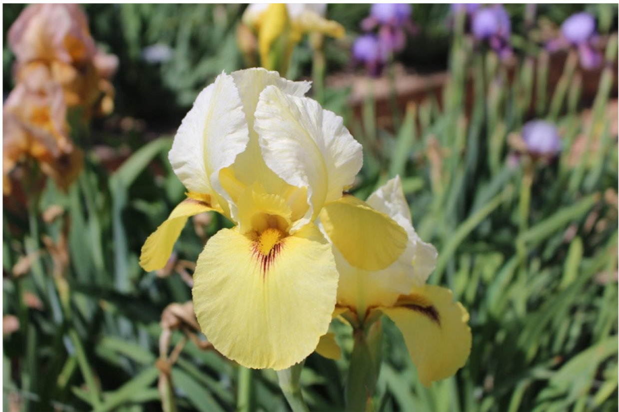
'Full of Surprises' (OGB+ 2007) 1/2+ aril

Plants of less than one-half aril complement should display branching almost equal to that of the Eupogon parentage. Branching of plants having one-half aril complement is expected to be intermediate between the aril and Eupogon parents. Half-bred cultivars involving tall bearded should usually display one branch, a spur, plus terminal, with a total of four buds. Some cultivars have more or less branching and number of buds, but the cultivar should be judged as a whole, giving proper considerations to flower and plant. Varieties of over one-half aril complement typically have no branching whatsoever.