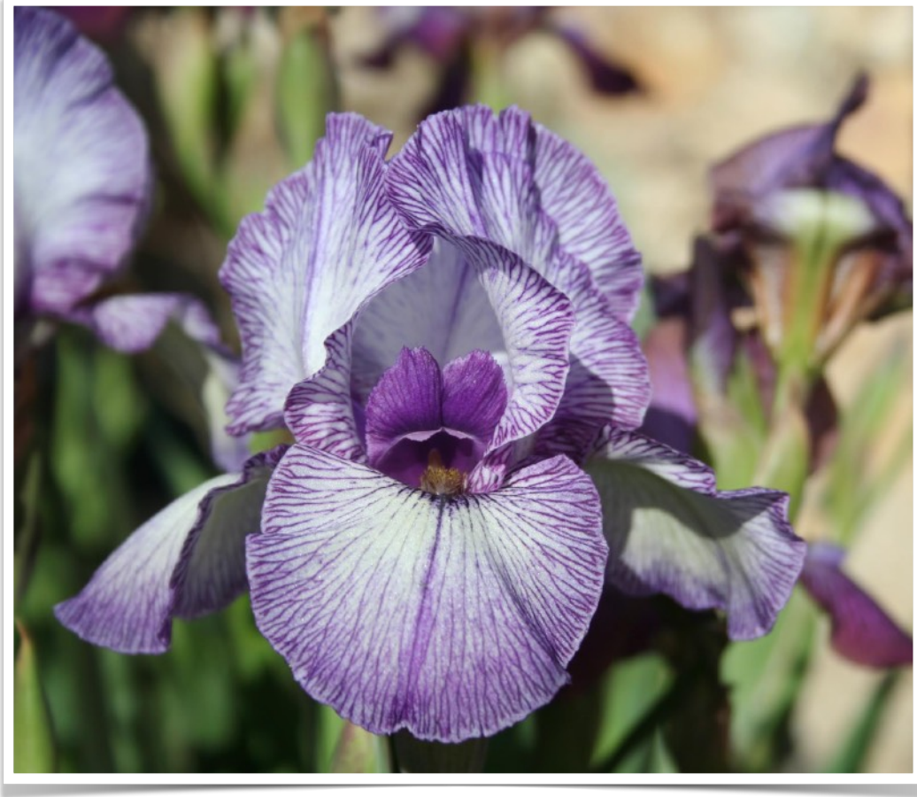
'Jonnye's Magic' (OGB 2010) 1/2 aril