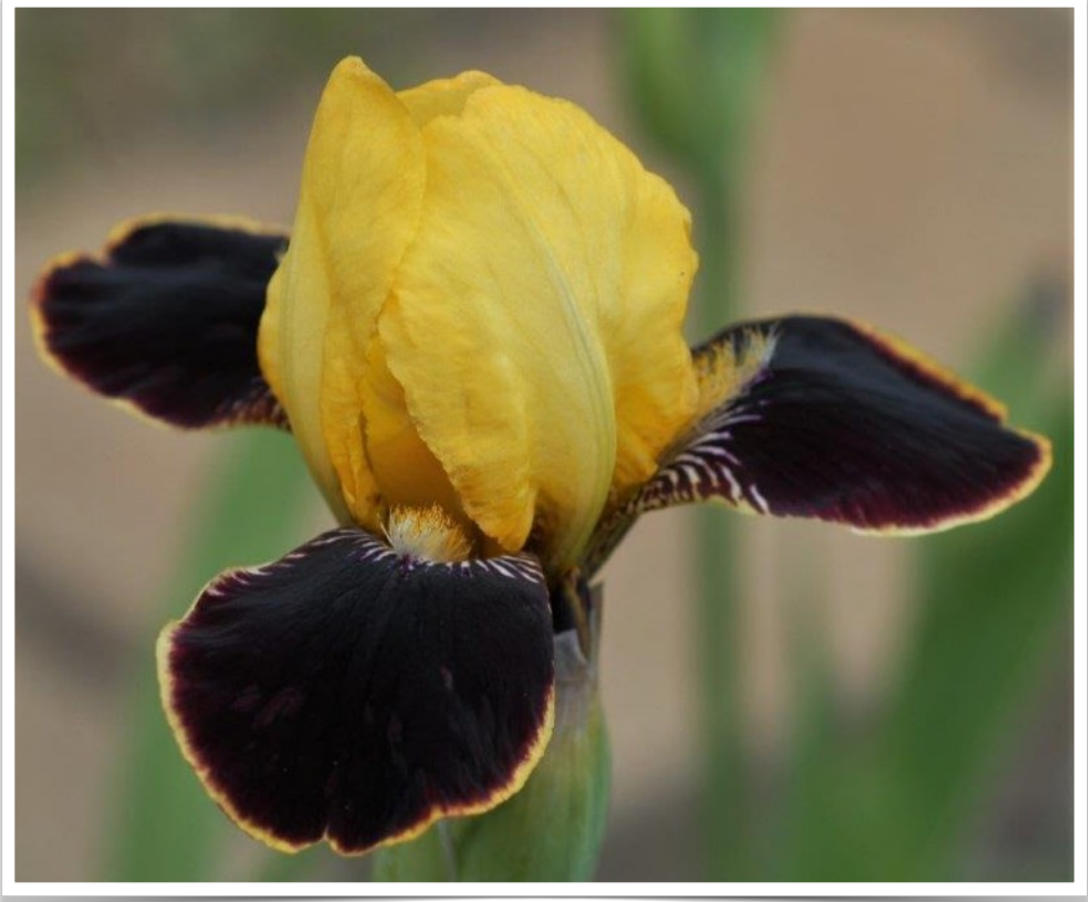
'Booyah' (MTB 2021) 🛛 📷 Kevin Vaughn

Exhibition judging evaluates the specimen as it is shown at the moment the judge sees it.