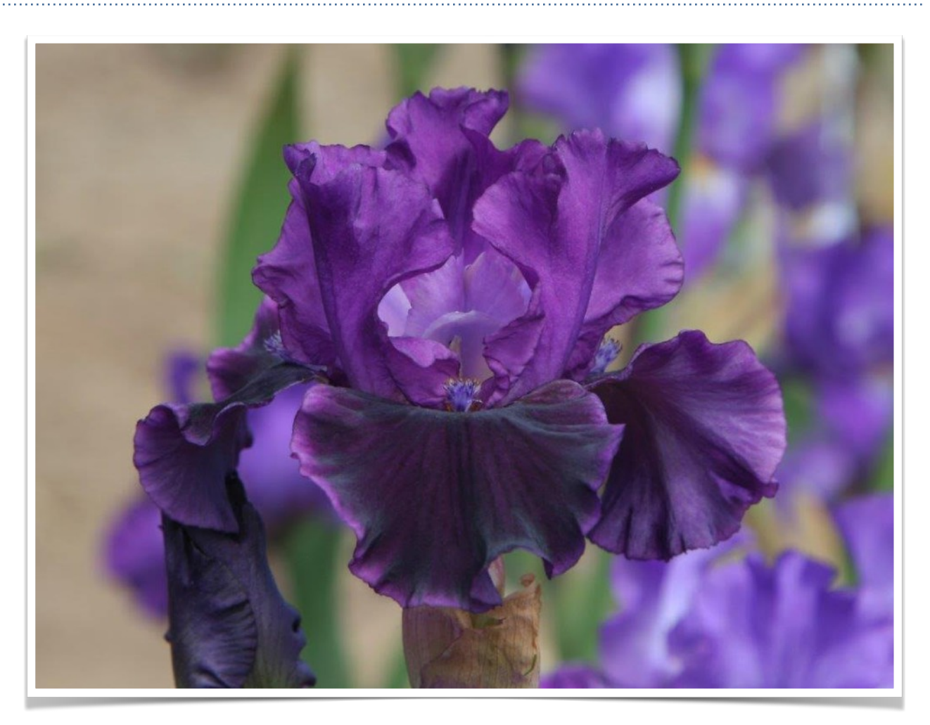
'Deep in the Heart' (MTB 2021) 🛛 📷 Paul Black

Miniature tall bearded (MTB) iris are not simply tall bearded iris with small flowers. All aspects of the plant are far daintier. Guidelines for stem diameter and the ratio of stalk to foliage have been set to reinforce this slender, graceful effect.